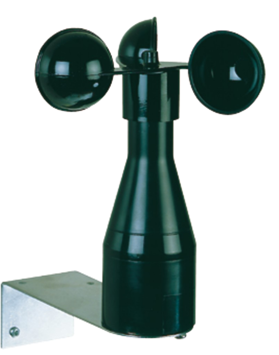
ADL-SR® wind sensor 0,5 - 40 m/s